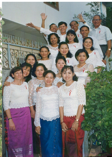
House of Hope staff at Christmas