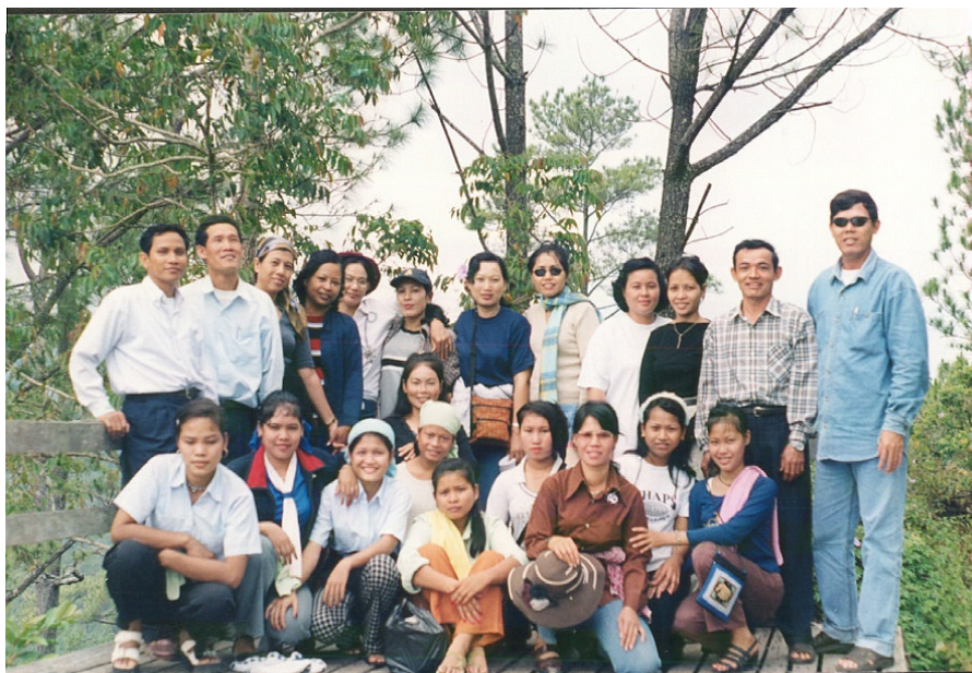
The HoH girls on their spring outing