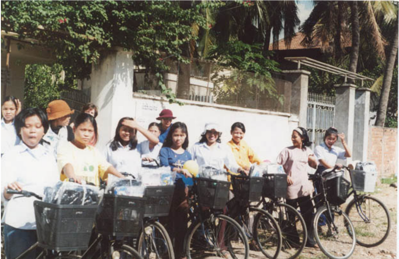
The House of Hope girls ready to deliver the bikes you purchased to the KPC Orphanage