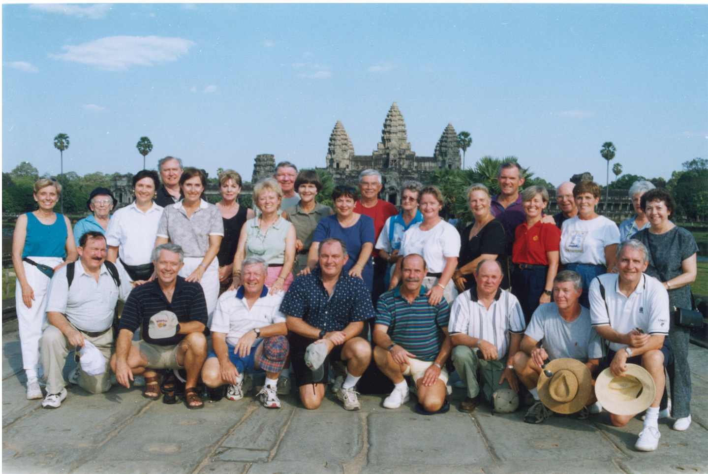
Rustic Tour Group at the entrance to Ankor Wat.

Rustic FAC Association 11 Poplar Avenue Shalimar, FL 32579-1113