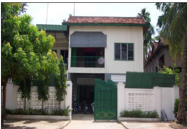
House of Hope Center