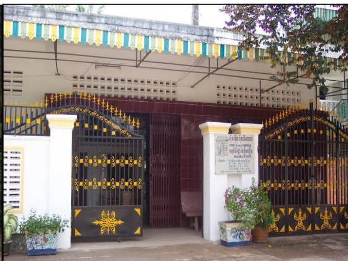
House of Hope Office