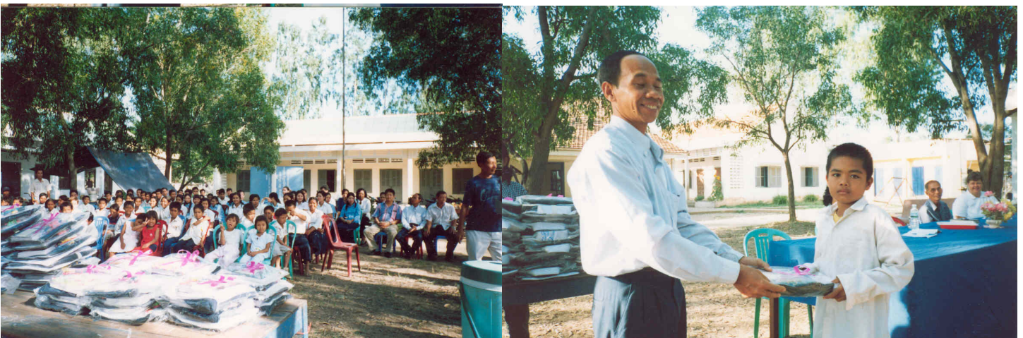
Children at the orphanage with gifts in foreground