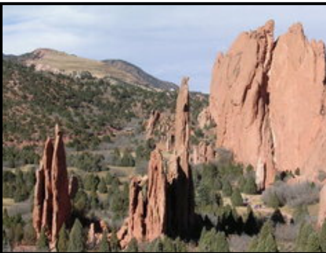
Garden of the Gods

One of the advantages to having the reunion in September is the fantastic fall foliage colors and the fact that we will probably miss the unpredictable weather that can come later in the fall. The complete 2013 USAF Academy football schedule won't be announced until March 2013, so we don't know if a game will be on the agenda. If there is no scheduled game that weekend, there will be plenty of tours/activities to keep us busy.