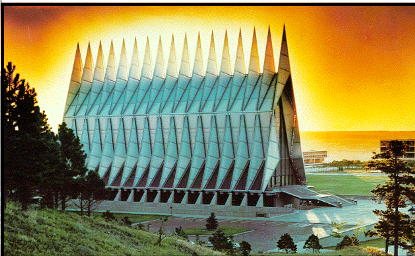
USAFA Cadet Chapel at Sunrise