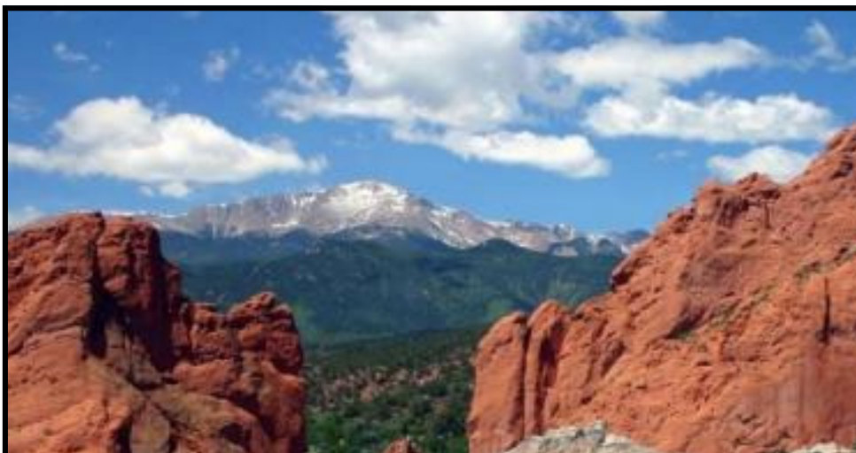
Pikes Peak towering behind the Garden of the Gods in Colorado