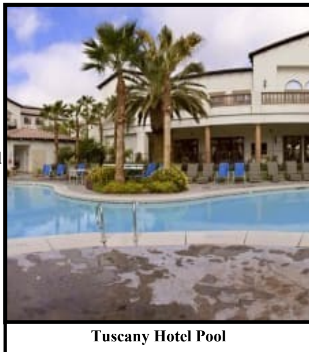
Tuscany Hotel Pool

A multiple course gourmet dinner is served in the Tuscany Gardens Italian Restaurant (This is a separate dining room from the Tuscany’s Marilyn’s Café). Dinner seating begins before the show at 5:30 PM and concludes after the show at 9:30 PM. You will need to contact the restaurant at (702) 947-5910 to secure your dinner seating time.