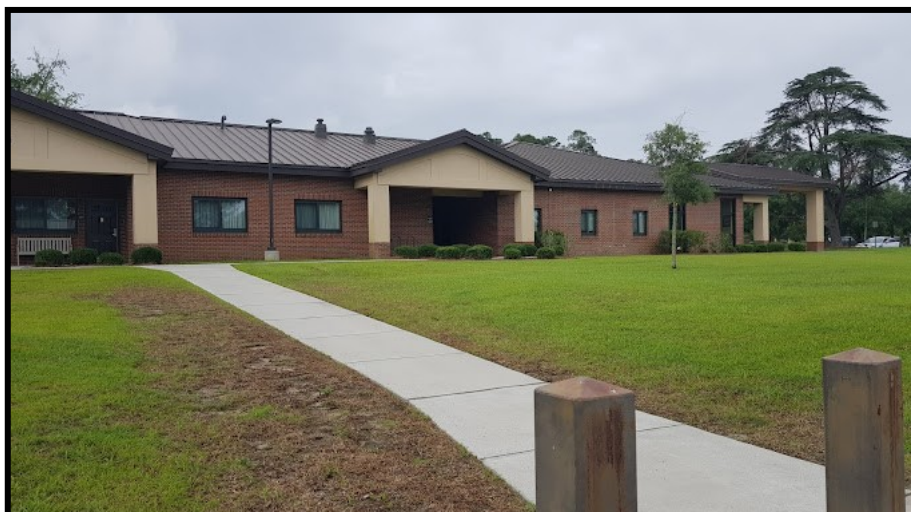
Moody Inn, 3213 Mitchell, Moody AFB, GA. 229-257-3893. Open 0600-2200

--25 Standard VQ rooms have been reserved for our reunion; however, more are available if needed. TLF Suites and DV Suites are available, if desired.