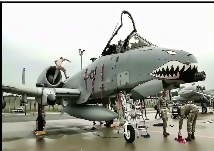
74 th Fighter Squadron A-10C Thunderbolt II's arriving in Estonia, 2015.