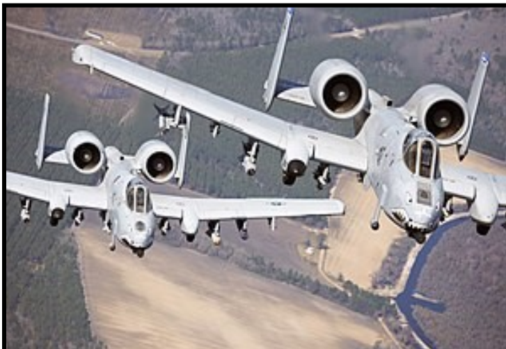
74 th Fighter Squadron A-10C Thunderbolt IIs.

The 74th FS's sister squadron at Moody AFB, the 75th FS, fly their FAC designated missions using the Nail callsign. As you recall, it was the Rustic and Nail FACs who flew the last FAC missions in Southeast Asia when the war came to sudden and final halt for all U.S. forces on 15 August 1973.