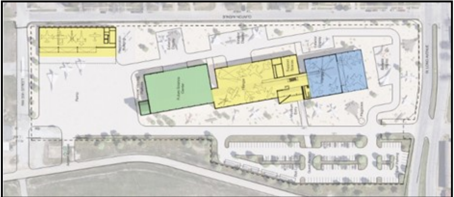
The expanded Ft Worth Aviation Museum and FAC Museum footprint. The new FAC museum will be the blue building located at the south end of the complex.

As a reminder, if you have FAC memorabilia that someday you'd like to have given to the FAC Museum, be sure you have this stated in your estate plan.