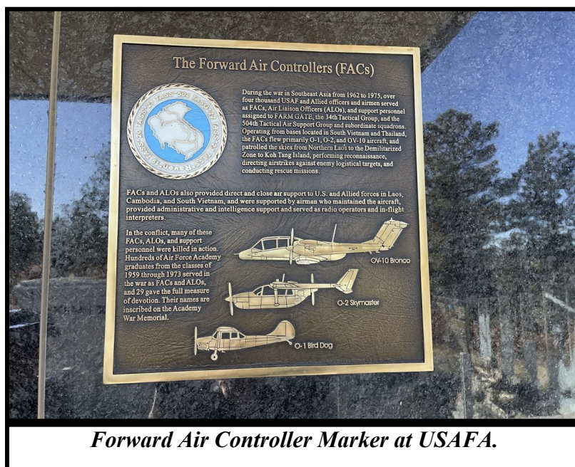
Forward Air Controller Marker at USAFA.

On Thursday, a tour of the Air Force Academy was conducted with stops at the visitor's center and the extensive veteran's memorial complex which houses innumerable unit markers to include several by FAC units. A short tour through the scenic Garden of the Gods followed. A membership meeting was held in the afternoon and the reunion banquet concluded events that evening.