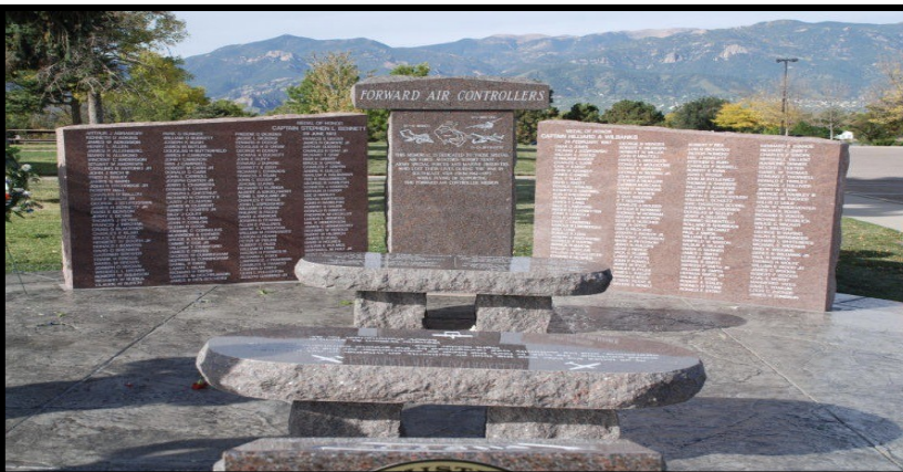
The Forward Air Controller Memorial

Highlights of the reunion included Tuesday's trip on 18 October to Denver's Wings Over the Rockies Air & Space Museum at the former Lowry AFB. In addition to viewing all the great aircraft and space displays, a dedication ceremony