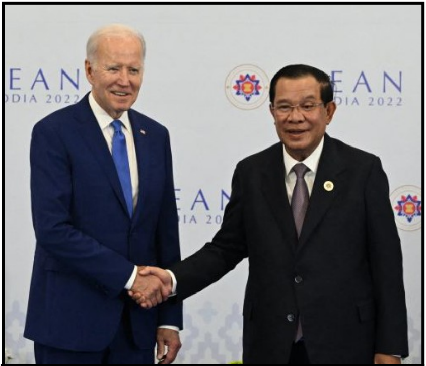
President Biden and Cambodia's Prime Minister Hun Sen at an East Asia Summit Gala, Nov 2022.

But on Thursday, a Cambodian official told CNBC that U.S.-China relations were critical to regional development in South Asia, and that the ASEAN countries were staying out of the economic competition between Washington and Beijing. "ASEAN remains neutral in this competition, and we don't want to choose sides," Kung Phoak, Cambodia's secretary of state of the Ministry of Foreign Affairs and International Cooperation, told the network. "ASEAN wants to work closely with both countries."